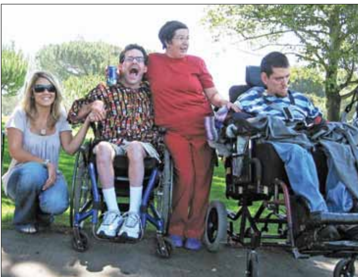
MSCH residents share a beautiful afternoon